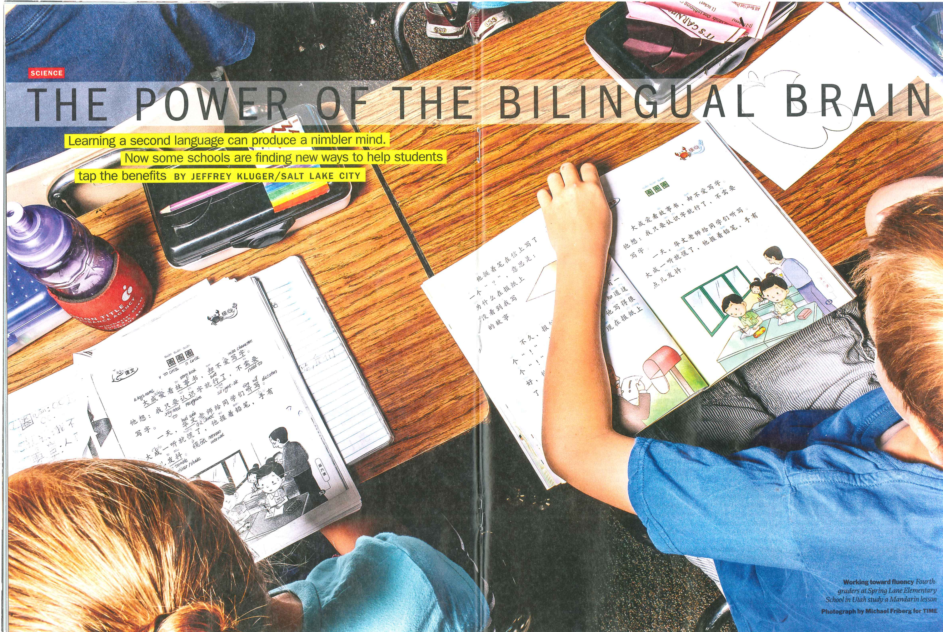
Working toward fluency Fourth-graders at Spring Lane Elementary School in Utah study a Mandarin lesson